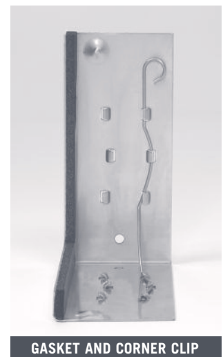
GASKET AND CORNER CLIP